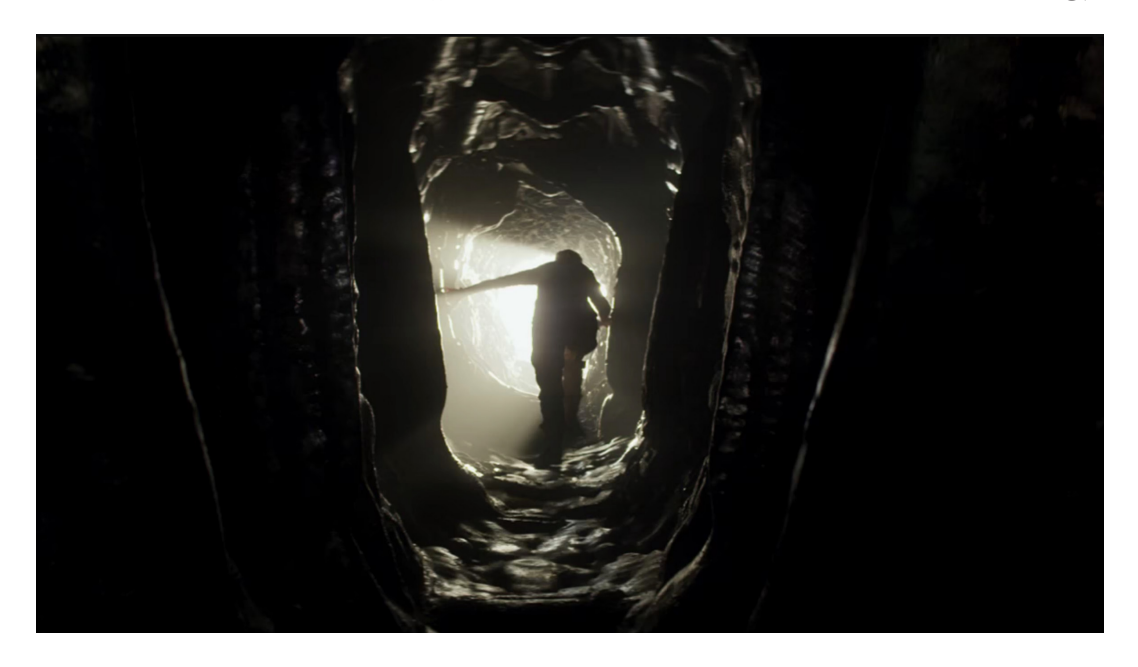
Figure 2. A womb-like cavern with vaginal-shaped shafts.<sup>19</sup>

A notable difference is that in the book the protagonist's husband already died from organ failure when she enters Area X to retrace his last steps. Also, the uncanny figure of the 'crawler' is absent from the film, while the inward-spiralling reversed 'tower' that lurks beneath the lighthouse in which this creature crawls is entirely different in the film. Womb-like catacombs with vaginal-shaped shafts leading towards its inner cavern, reminiscent of H. R. Giger's artwork for Alien, define this space (Figure 2). A subdued allusion to the tower is made in the film by using the name 'Lena' (short for Magdalena), whereas in the trilogy she is an unnamed character only referred to as 'the biologist' or 'ghost bird'. Annihilation does not necessarily reference the biblical figure, but points towards Magdalena's Hebrew origin, connoting the word 'tower.' This meaning is not arbitrary, nor is the fact that Lena is not merely a biologist, but one specializing in studying cancer cells, a life-cycle which is akin to the Shimmer's functioning. Cancer radically alters DNA, growing and mutating at an exponential rate, as the opening shots of the film display, just like the Shimmer drastically alters all DNA present in the infected and exponentially increasing Area X. Although the film is not an 'accurate' adaptation, it does draw on the same conceptual structures that lie at the heart of the trilogy.