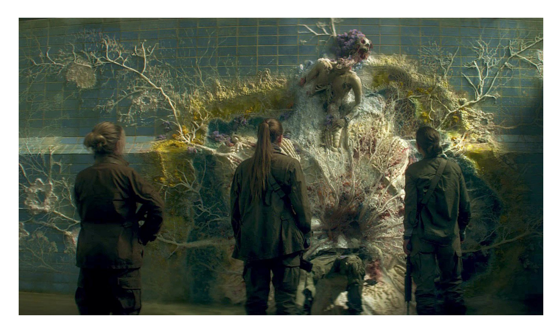
POSTHUMAN PRISMATIC COLOUR IN ANNIHILATION

Figure 3. Human-floral-fungal mosaic assemblage.<sup>22</sup>