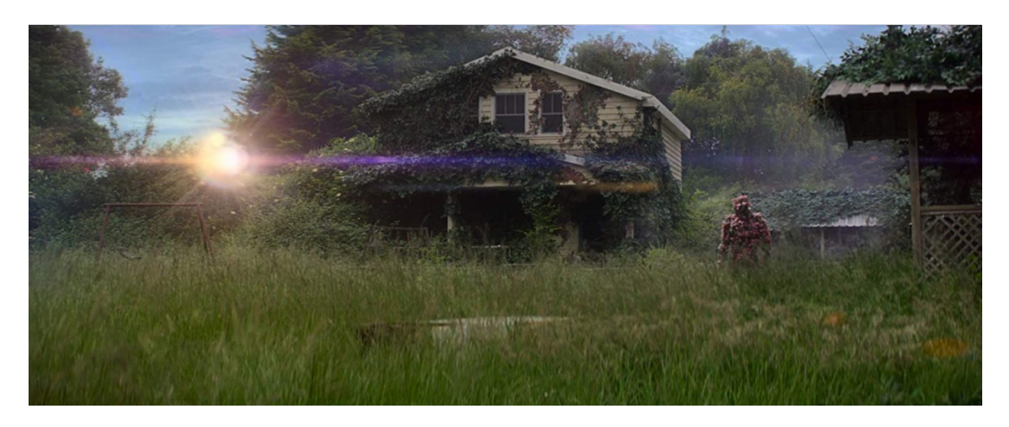
Figure 5. Humanoid shaped 'plant.'<sup>27</sup>

Two distinct types of iridescent colour-scapes exist in Annihilation's diegetic world. In the first part of the film an ethereal milky-white opalescent chromatic register manifests itself, which is prevalent in most outdoors 'nature' sequences within the Shimmer. The second is a menacing oily-black polychromatic register, which is featured in the concluding scenes inside the lighthouse, where Lena encounters a shiny, sleek alien figure<sup>24</sup> which morphs into her doppelgänger. Both these posthuman colour-schemes contrast sharply with the human hues of the 'normal' world outside the Shimmer. Film scholar John Belton argues in "Painting by Numbers" that black-and-white imagery versus colour instances in films such as Sin City (Miller, 2005) and Pleasantville (Ross, 1998) operate within distinctly different diegetic registers. The colour instances function as "hallucinatory fragments of colour that exist in a diegetic limbo-neither quite inside the story space nor outside of it."25 Furthermore, Belton claims that "colour manipulation poses a potential threat to our traditional understanding of chromatic and achromatic colour systems and their creation of a credible narrative space."26 One could transpose this argument onto the outlandish colours of Annihilation and argue that, in comparison to the 'normal,' human hues outside Area X, both posthuman iridescent colour-scapes operate in a similar fashion.